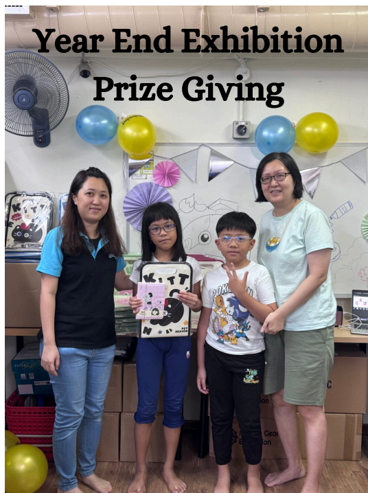
Year End Exhibition Prize Giving